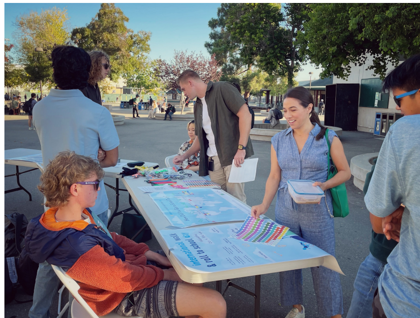
Caption: Students celebrating International Walk and Roll to School Day.

See page 5 for our standard poster, and page 6 for our larger poster with translated text. These are also available on the IWR2SD event webpage .