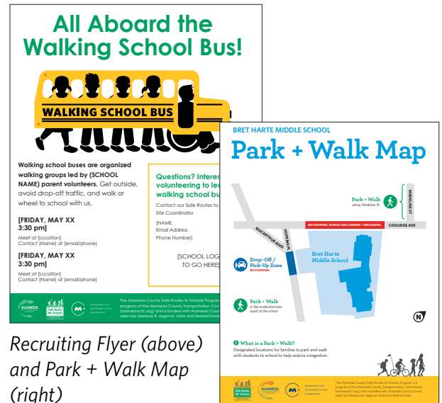
Recruiting Flyer (above) and Park + Walk Map (right)

The Alameda County SR2S Team has a limited number of high-visibility vests to provide to Route Leaders and Walking School Bus Yard Signs to alert participants of the meet-up locations.