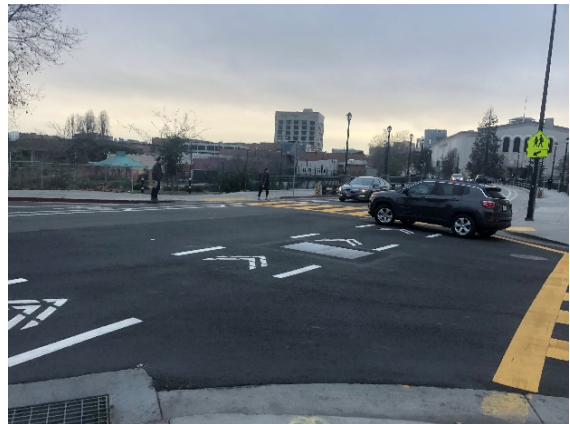
Left: E 10th Street, looking south at queuing vehicles waiting for a crossing pedestrian.