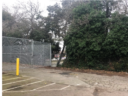
Left: Street parking near Dewey Academy, including the public handicap stall.