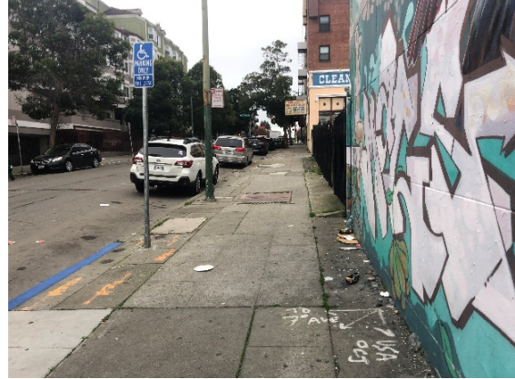
Left: East Bay Bus Rapid Transit-related construction at 2 nd Avenue and International Boulevard. Right: One of the sidewalks on 2 nd Avenue, approaching E 12 th Street.