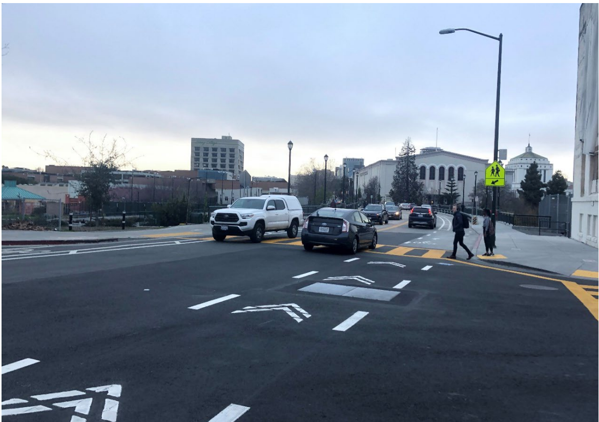
Above: Vehicles failing to yield to pedestrians crossing E 10 th Street.