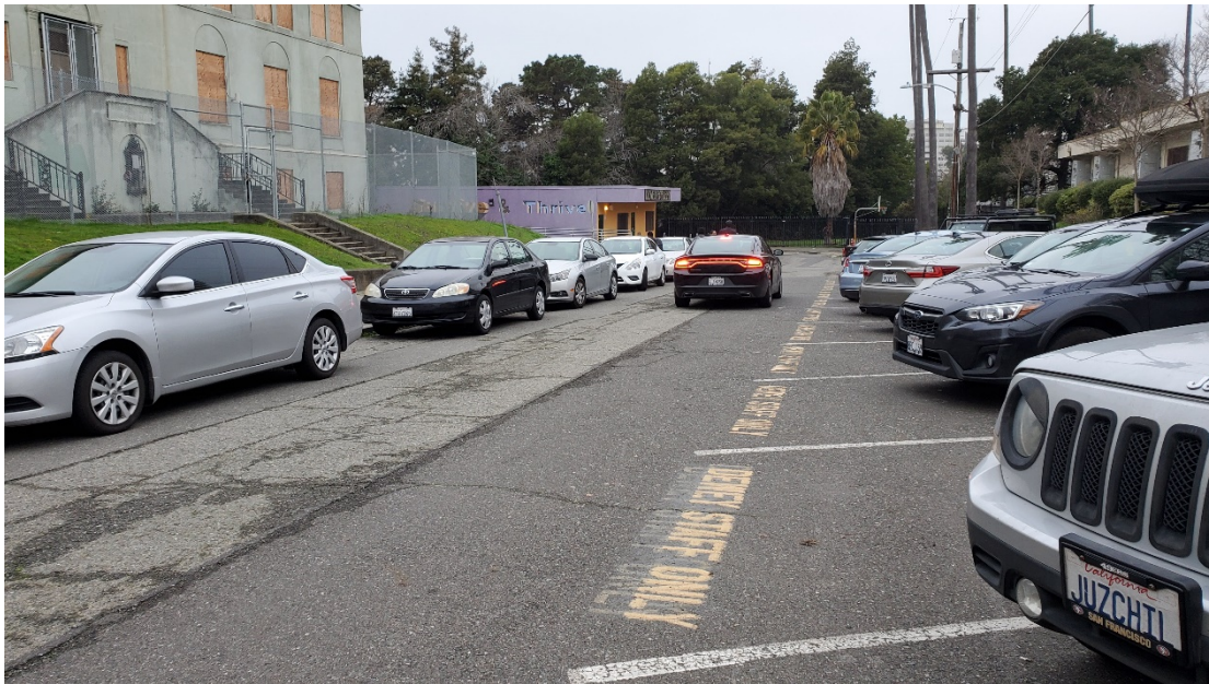
Above: E 11 th Street, looking towards the Lake Merritt channel.