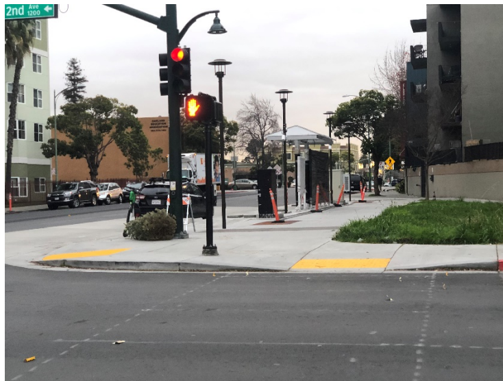
Above: The unopened far-side southbound stop at E 12 th Street and 2 nd Avenue for East Bay BRT and other AC Transit lines.