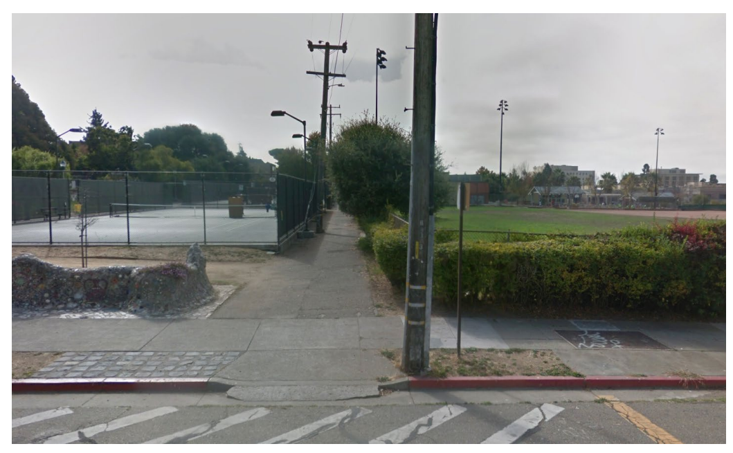
Path connecting Derby Street to Willard Middle School back entrance

• There is a narrow paved path that connects Derby Street to a back entrance to Willard Middle School. Currently the back entrance gate is not open during drop-off and pick-up times, and parents and teachers mentioned that there was poor lighting of the path and overgrown vegetation.