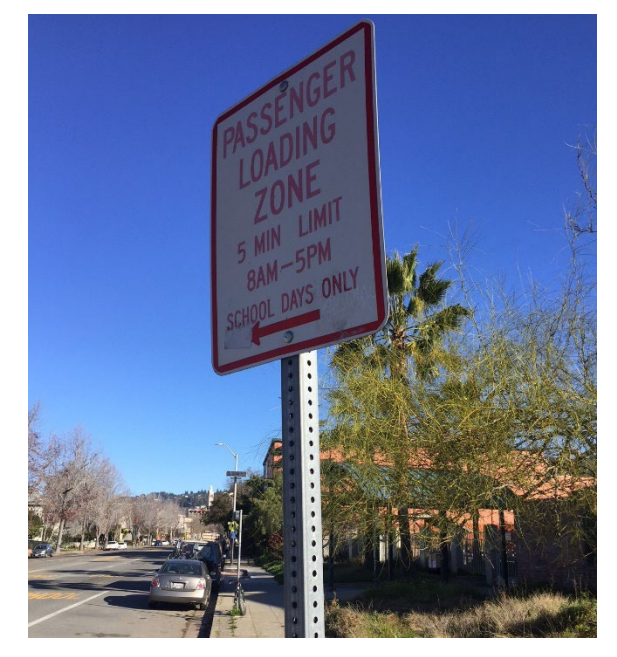
Left: Telegraph Avenue student entrance Right: Student drop off curb along Telegraph Avenue