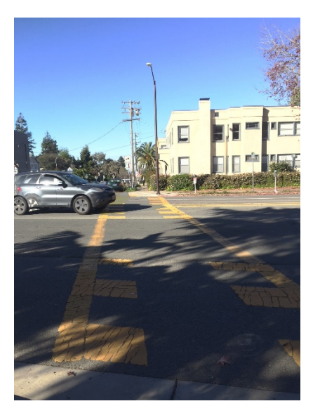
Left: Telegraph Avenue and Stuart Street intersection Right: Midblock uncontrolled crosswalk at Telegraph Avenue and Ward Street