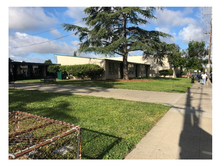
The main entrance to Roosevelt Elementary, on the Dowling Boulevard side

Roosevelt Elementary School is located in San Leandro with its primary frontage along Dowling Boulevard, and secondary frontage along Dutton Avenue, a major crosstown arterial road. Roosevelt Elementary does not have a drop-off loop. Most Roosevelt Elementary students arrive to campus via private automobile. Dowling Boulevard is the primary access point for most students and families. Some families were observed parking on nearby streets and walking along Dowling to access the campus.