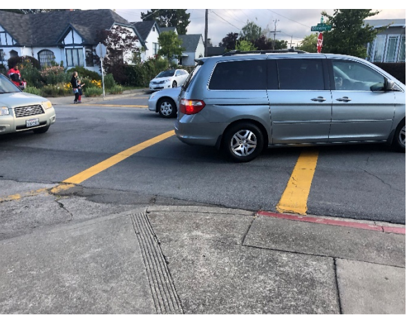
Left: The Dowling Boulevard/E. Merle Court intersection, looking west from the southeast corner

Right: The transverse crosswalk at the eastern approach being blocked by two cars with an additional car blocking the intersection