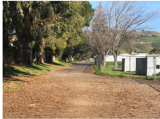
Right: This is where the path transitions from paved to unpaved (looking toward Whitman).