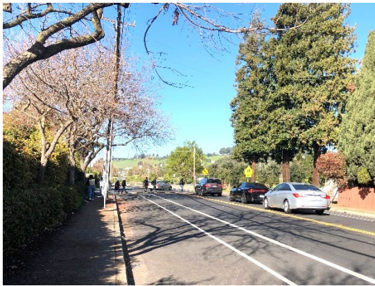
Left: Students crossing Whitman Street walking towards the overpass.