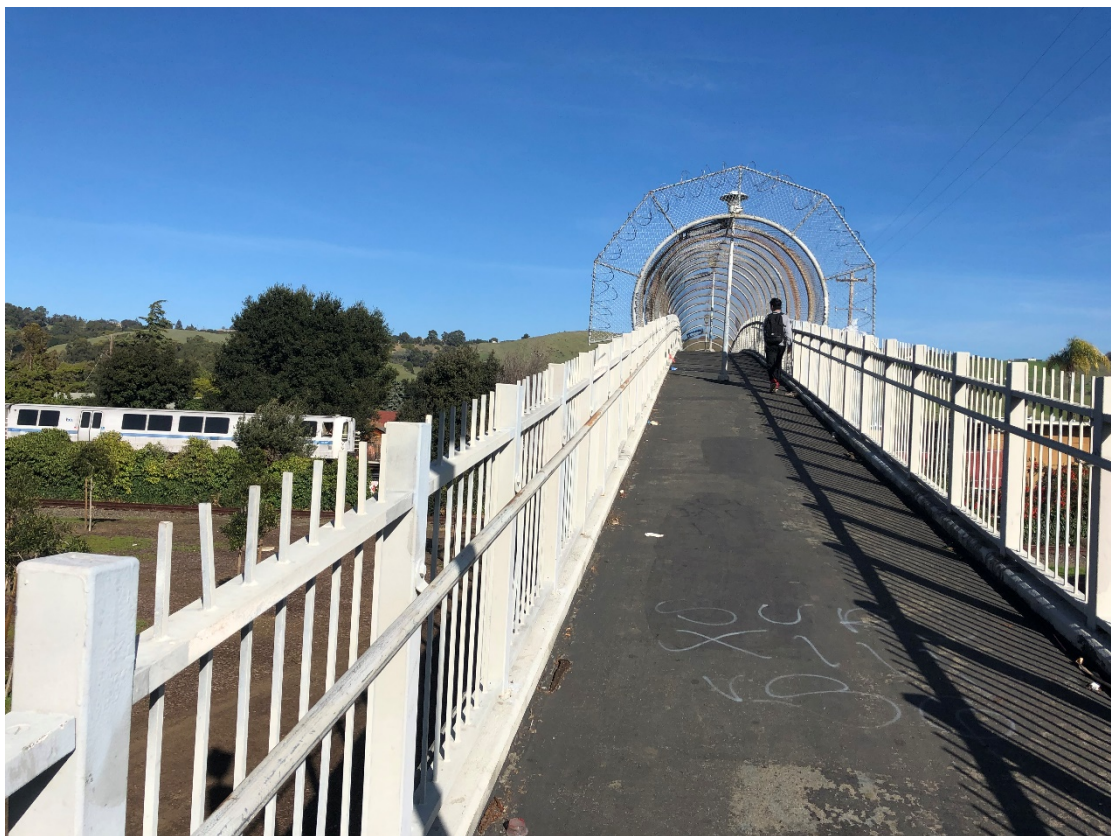
Above: The pedestrian overcrossing, just after the stairs, looking east.