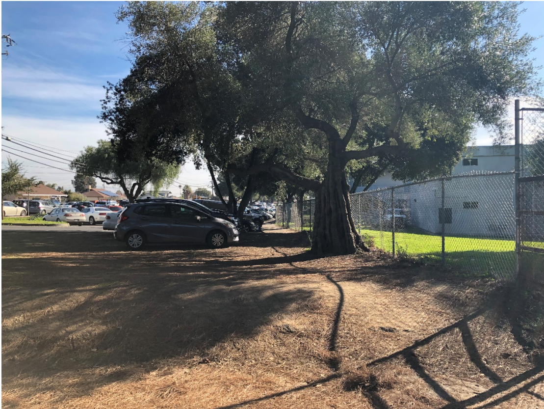
Above: The overflow staff parking area, looking from the path.