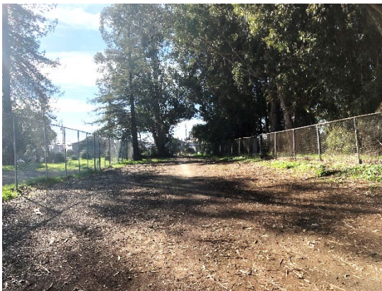
Left: The path connecting Huntwood Avenue and Whitman Street along the northern edge of campus (looking towards Huntwood).