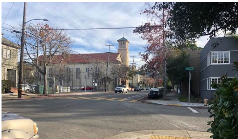
Above: View of uncontrolled crossing and crosswalk across Alcatraz Avenue at Dana Street