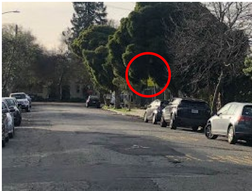
Above: School Zone signage (MUTCD - SW24-1) is obscured by trees and vegetation on Dana Street.