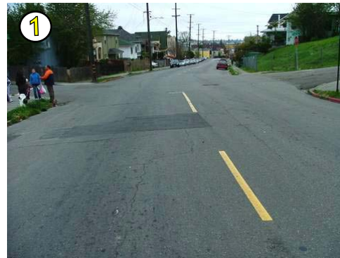
East 26th Street at 23rd Avenue