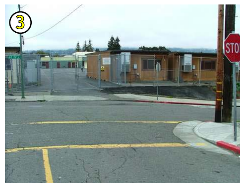
East 26th Street at 24th Avenue