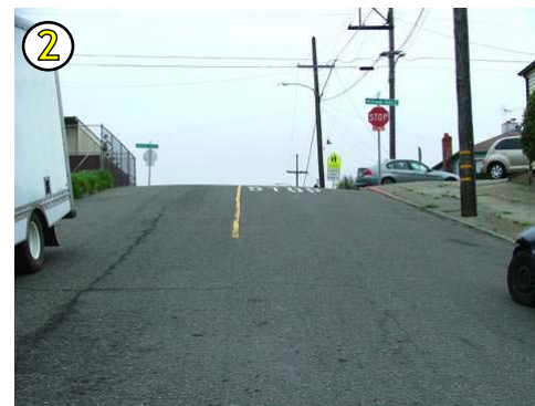
East 26th Street at Grande Vista Avenue