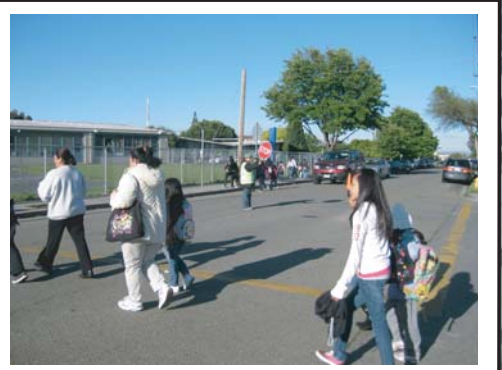
Stop control recommended at Longwood Ave and Blackwood Ave intersection.