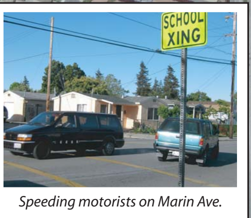
Speeding motorists on Marin Ave.