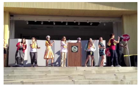
Dougherty staff strut their stuff to the Safe Routes "Ped Safety Dance" to encourage students to meet their Walk & Roll to School Day goals.

Dougherty Elementary prepared for International Walk & Roll to School Day with