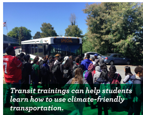
Transit trainings can help students learn how to use climate-friendly transportation.

The Spare the Air Youth Program high school grant application for 2019-20 is now open and applications are due on May 1 . The program funds high school student-led efforts that have the potential to reduce greenhouse gas emissions from transportation through activities that encourage students to use climate-friendly transportation options such as walking, biking, carpooling, and public transportation. To learn more about the grant and application process, please click here .