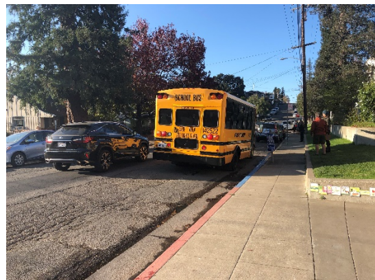
Left: The drop off lane on 39 th Avenue, looking towards Aliso Avenue.