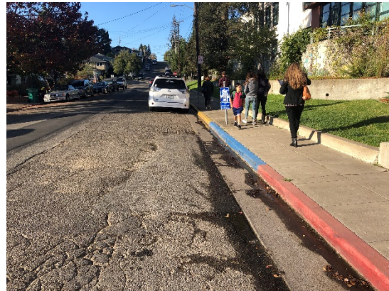
Left: The drop off lane on 39 th Avenue, looking towards Aliso Avenue.