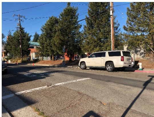
Left: The two transverse crosswalks at the Aliso Avenue/39 th Avenue intersection, looking west. Right: Looking down 39 th Avenue, towards the drop off loop. The advance stop markings are very faded at the approach.