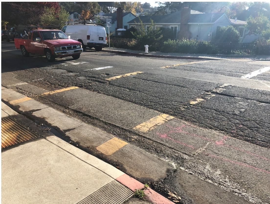
Above: The faded advance stop markings and crosswalk across 39 th Avenue.