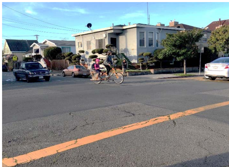
Parent biking with their students to Yu Ming Charter School.