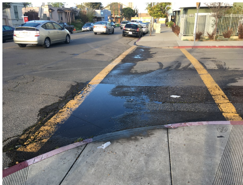
Water pools on crosswalk across Salem Street