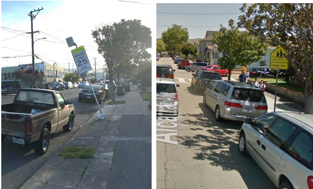
Left: School speed limit sign is bent to the left