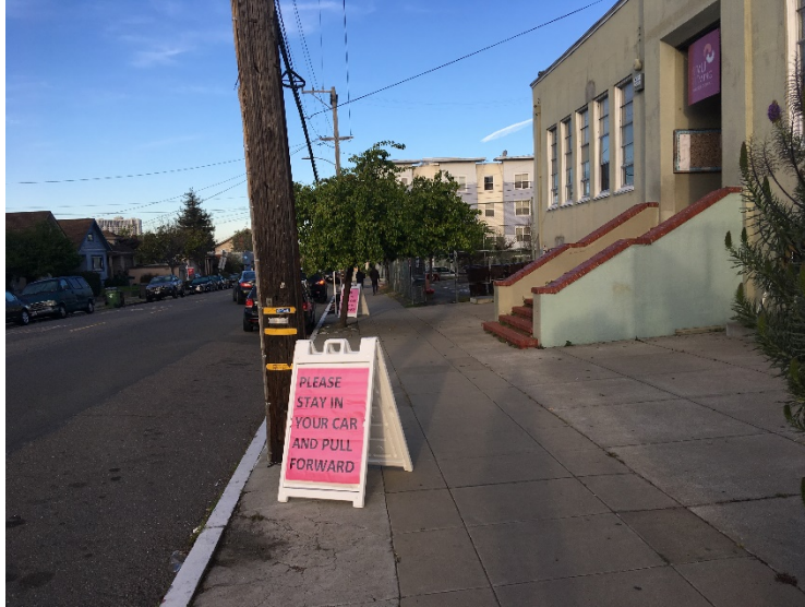
Signs on Alcatraz Avenue instruct families to stay in their car and pull forward