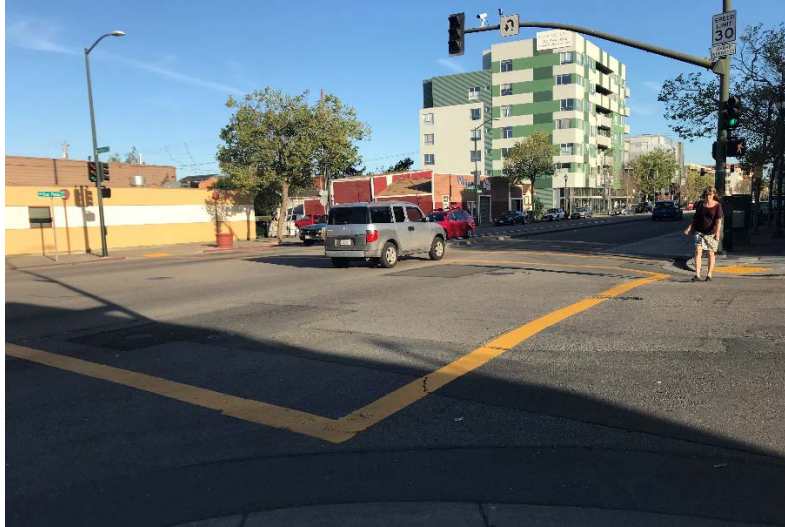
San Pablo Avenue and Alcatraz Avenue intersection.