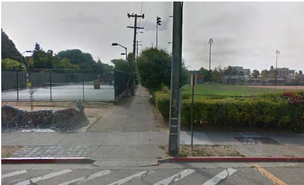
Path connecting Derby Street to Willard Middle School back entrance