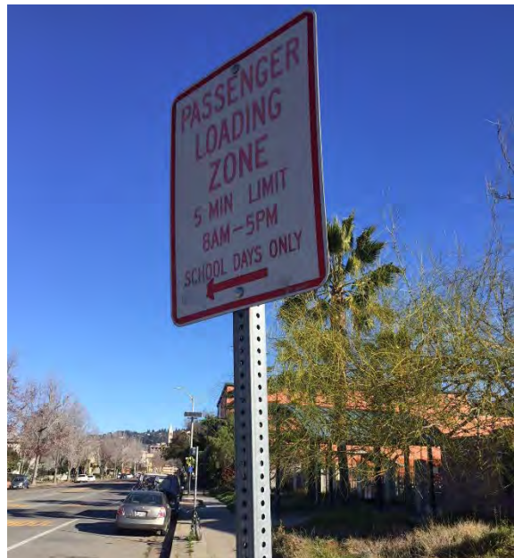
Right: Student drop off curb along Telegraph Avenue