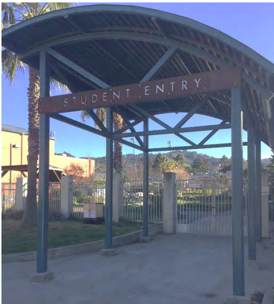
Left: Telegraph Avenue student entrance