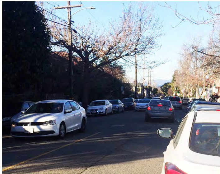
Drop off occurs on both sides of Stuart Street