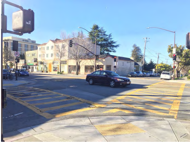
Left: Telegraph Avenue and Stuart Street intersection