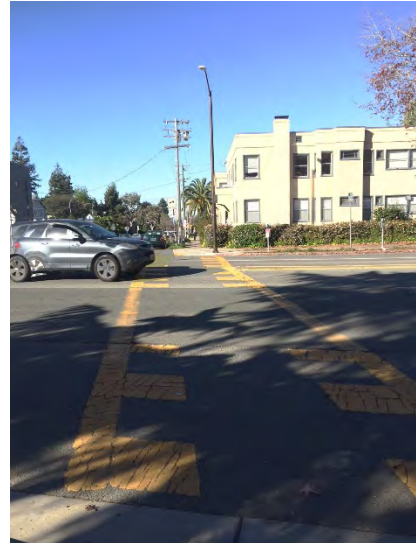
Right: Midblock uncontrolled crosswalk at Telegraph Avenue and Ward Street