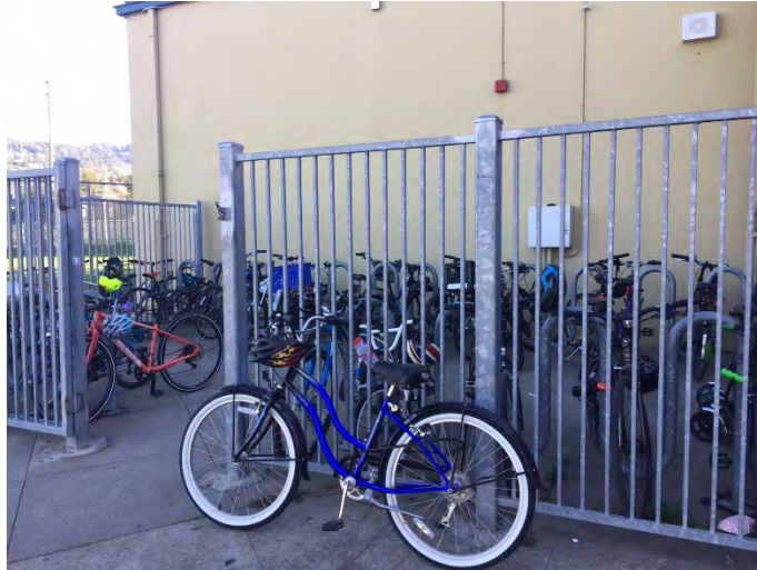
Semi-enclosed bike parking area on Willard Middle School campus