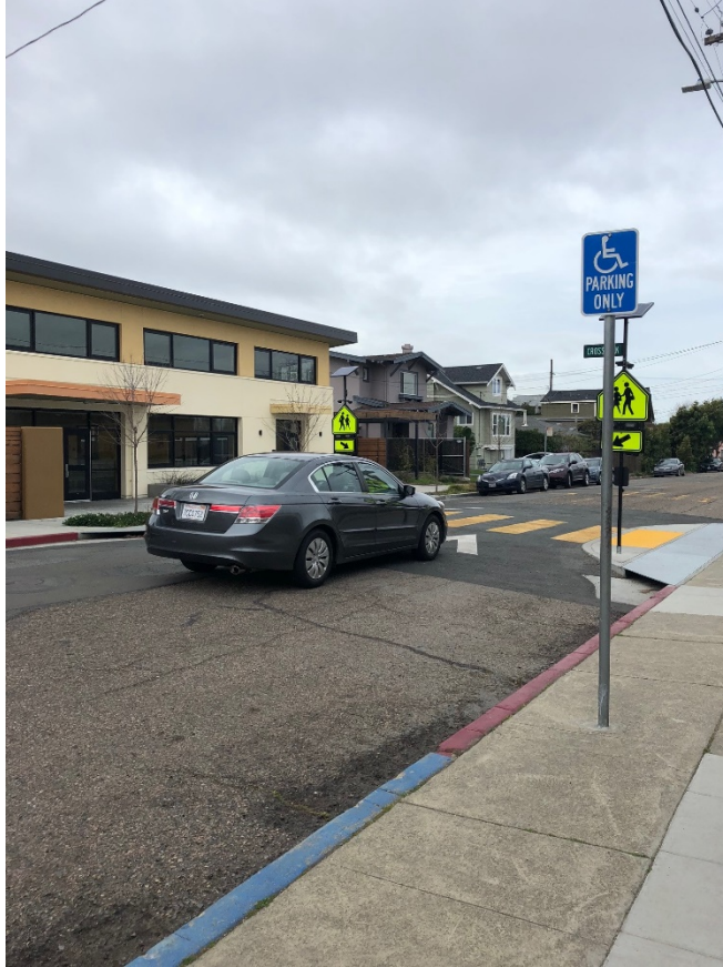
Raised crosswalk and pedestrian activated beacons across Ward Street connects students from classrooms to cafeteria.