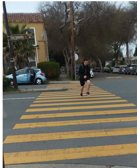
Right: Student dashes across Sacramento Street to avoid fast-moving traffic.