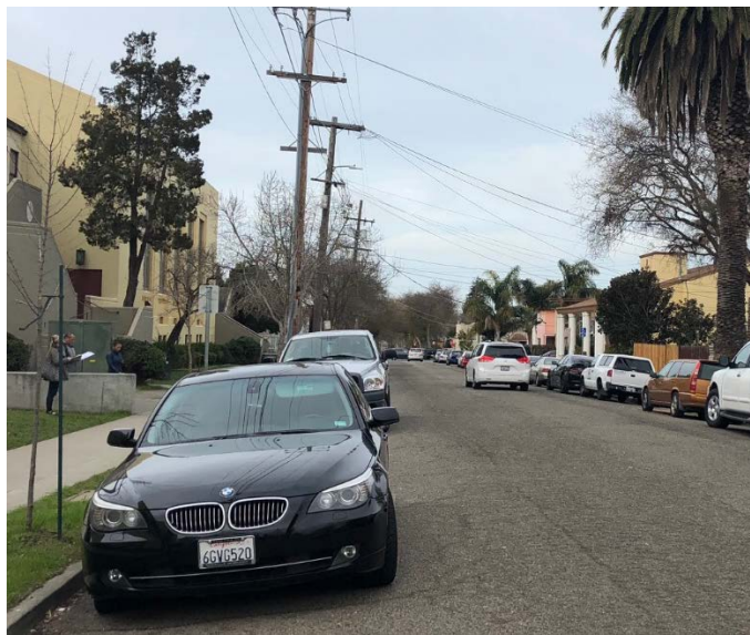
White minivan double parked in the travel lane opposite the school entrance on Derby Street.