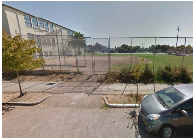
Sidewalk is crumbling and has dirt tracked across its width