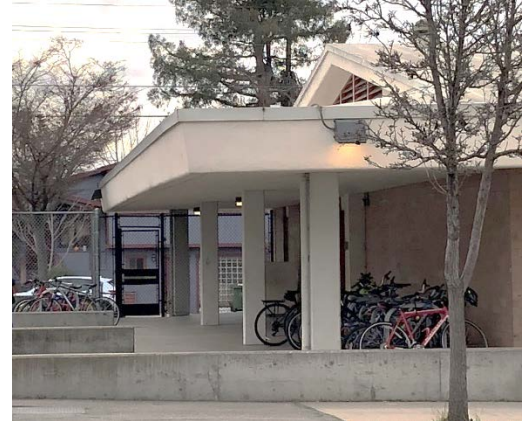
Bike and scooter parking areas in the central courtyard