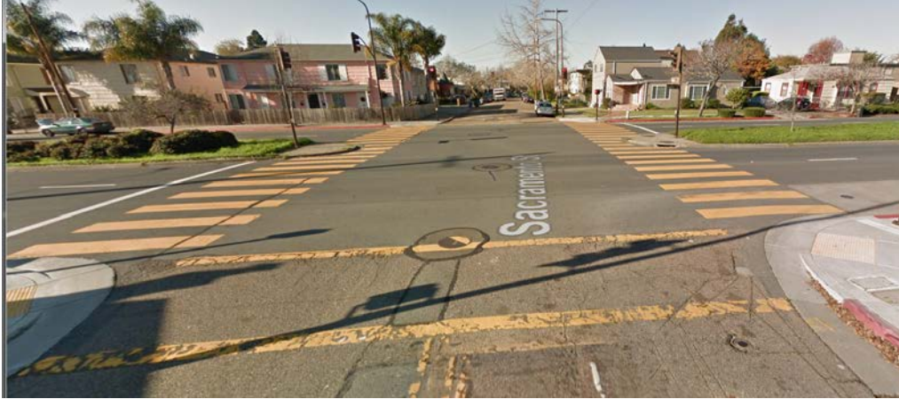
Intersection of Sacramento Street and Ward Street.