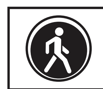
Leading Pedestrian Interval