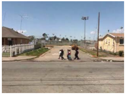
Students access school via Hamilton Street.