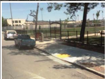
Blue curb is needed at curb ramp entrance to Greeman park.