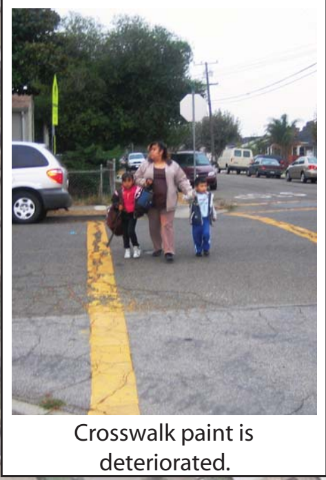
Crosswalk paint is deteriorated.