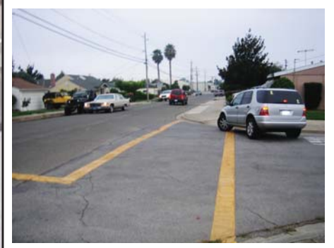
Motorists frequently u-turn on Aurora Drive at State Street and Walnut Drive