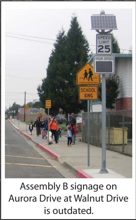
Assembly B signage on Aurora Drive at Walnut Drive is outdated.