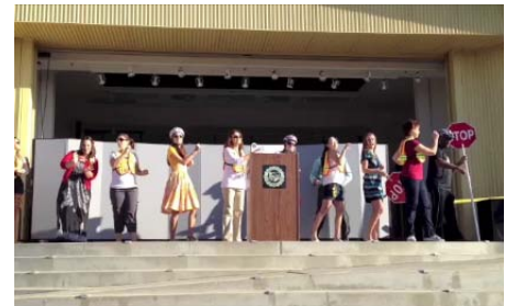
Dougherty staff strut their stuff to the Safe Routes "Ped Safety Dance" to encourage students to meet their Walk & Roll to School Day goals.

Dougherty Elementary prepared for International Walk & Roll to School Day with